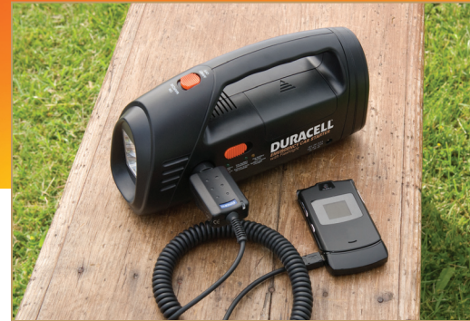
Powers 12-volt devices