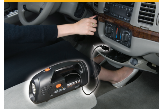
Safe and easy to use